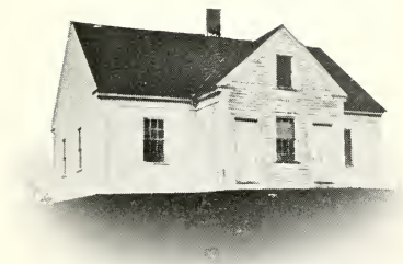
THE MEETING HOUSE.